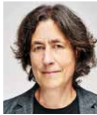
Chantal Hébert, OC, CQ

Decorated Naval Officer and Leadership Strategist